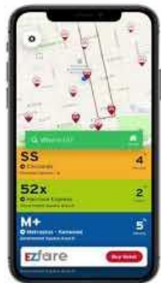
How To Use Transit App